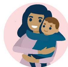
support attachment and safe, secure base from which the child can explore, learn and grow