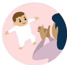
serve and return