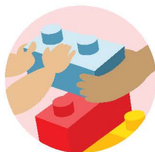
support brain development